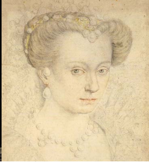
Portrait of Louise of Lorraine (1553-1601), wife of Henri III, drawing, anonymous, 16 th century, National Library of France. From 1580 to 1583, the queen spent long periods at Bourbon-Lancy to take the waters and treat her sterility. A source there was even named «the Queen's source».