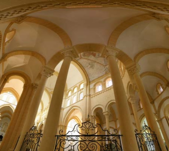
Panoramic view of the Paray-le-Monial Basilica ambulatory (12 th century).

The term «Romanesque» first appeared in the 19 th century to designate Medieval art from the 11 th and 12 th centuries, i.e. the period in religious architecture characterised by a desire to cover (or vault) stone edifices while enabling more light to penetrate the interior. This quest would lead to the advent of Gothic art. The basilica in Paray-le-Monial, this region's architectural masterpiece, heralded a breakthrough in building techniques with its: 21-m high single-barrel vaulted nave, raised window openings, apse with delicate supports, and light streaming in through three-storey bay openings.