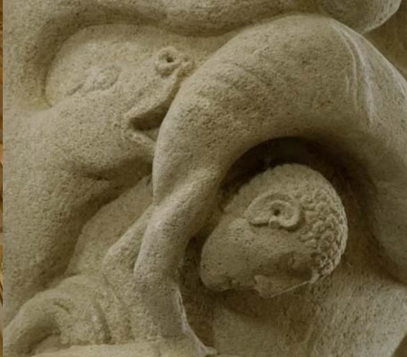
Capital sculpted into the nave at the Anzy-le-Duc church (12 th century).