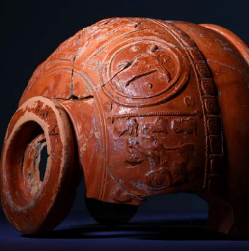
Example of Samian ware pottery produced in Quinimum (Gueugnon) around the 2 nd or 3 rd century AD, object on display at the Museum of Gueugnon Area Heritage.

Like its landscapes, Charolais-Brionnais' history has been shaped in large part by residents, but also by its geographic position and natural advantages.