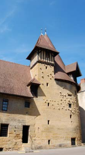
The Mill Tower in Marcigny, a 15 th -century fortified construction, today used as a museum.