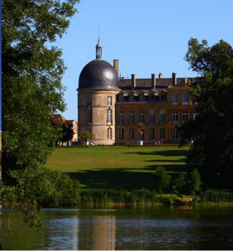
Digoine Castle (18 th century).