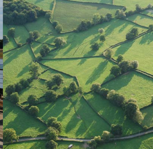
View of local area pastureland.