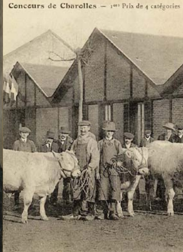
Breeders participating at the agricultural competition in Charolles, beginning of the 20 th century, postcard, Departmental Archives.