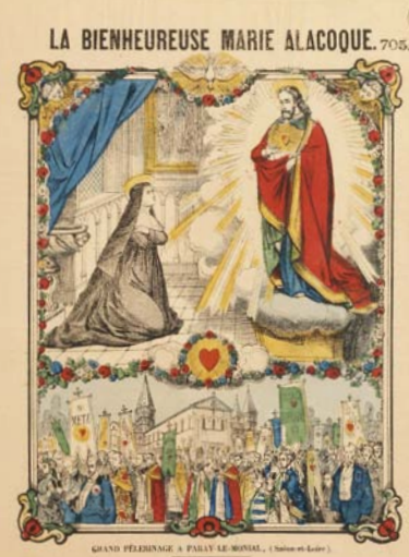
The beatified Sainte Marguerite-Marie Alacoque and the Sacred Heart of Jesus, engraving, 19 th century, National Library of France. Fine example of popular prints.