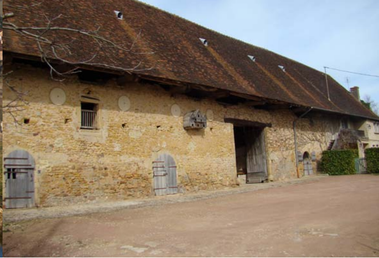
Typical Charolais farm in Champlecy. The outbuildings (stables, hangar for hay carts) and residence were built together abutting one another and combined under the same overhanging roof.