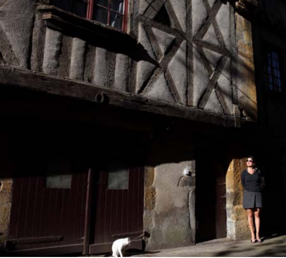
Half-timbered house in Marcigny (on the Impasse de la boucherie).