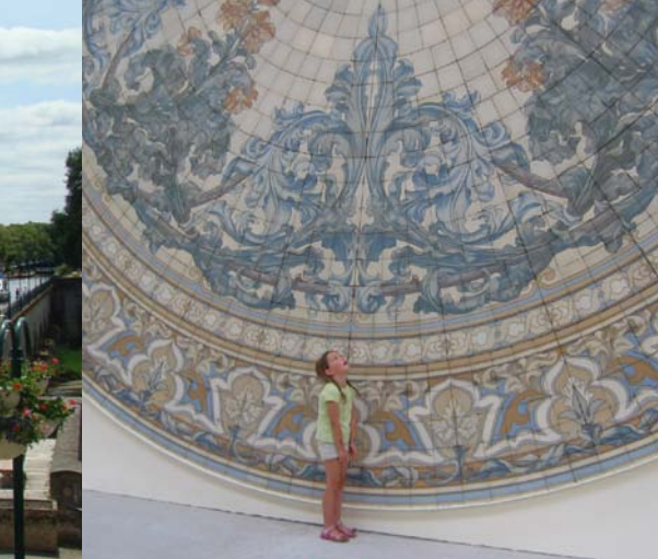
Rose window on the Paul Charnoz factory building, composed of 4,256 ceramic tiles and gold medal winner at the 1900 World's Fair, Paul Charnoz Museum.