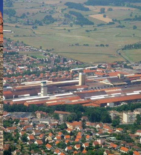
View of Gueugnon, an industrial centre located amidst the region's pastureland.