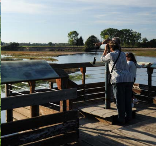
Site of Le Petit Fleury, on the Loire's banks in Bourbon-Lancy.