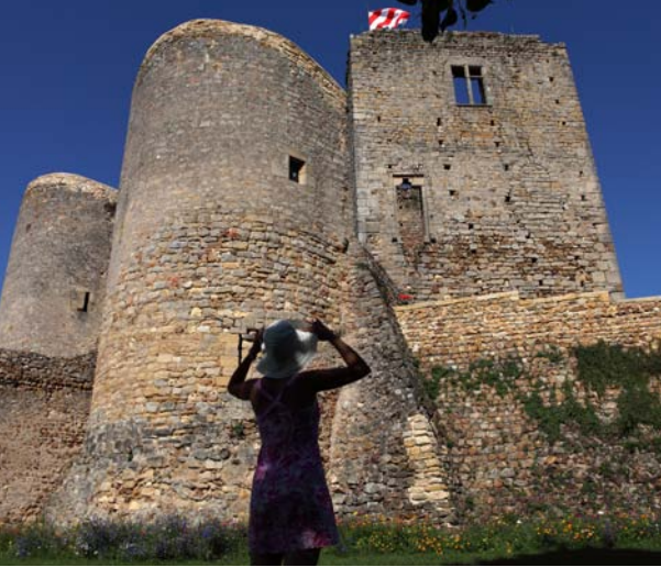
View of the Semur-en-Brionnais dungeon