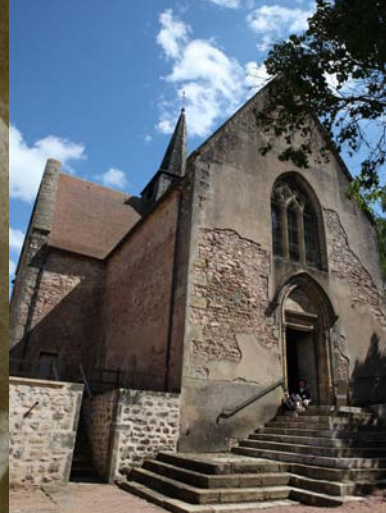
Gothic architecture is not widespread locally, especially when observing the quality of Romanesque edifices. The few specimens, like the Sainte-Avoie Chapel in La Clayette (15 th century), appeared later

Various architectural solutions have undergone experimentation. In Iguerande, the nave is darkened (devoid of windows) and covered by a barrel vault. The layout in Anzy-le-Duc is lit thanks to tall windows and rib vaults. The hosting of spiritual pilgrims, on their itinerary to pay homage to relics, has led to a number of renovations: an ambulatory and radiating chapels in Paray, the crypt in Anzy. The church in Issy-l'Évêque and the collegiate church in Semur-en-Brionnais, both more recent constructions (mid-12 th century), provide a synthesis of this architectural period. On the outside, the bell tower looms large. The Anzy-le-Duc and Châteauneuf steeples are quite distinct for their multiple levels of openwork.