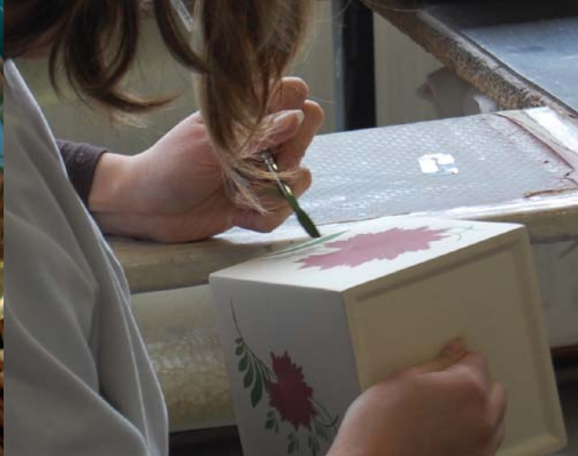
Decoration specialist at work in the Charolles earthenware factory.