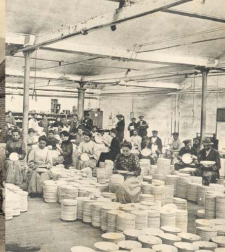
Digoin earthenware selection workshop, employing up to 1,700 personnel, photograph from the beginning of the 20 th century, private collection.