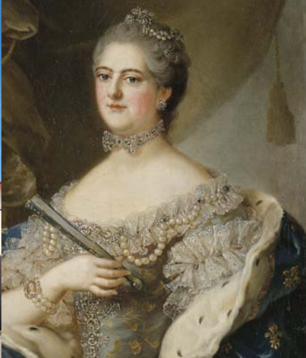
Portrait of Elisabeth-Alexandrine de Bourbon-Condé, known as Mademoiselle de Sens (1705-1765), oil on canvass, painted by Jean-Marc Nattier, 18 th century, Château de Versailles. Charolais' last countess, she resold the work to the Crown in 1761 in exchange for the Palaiseau plot.