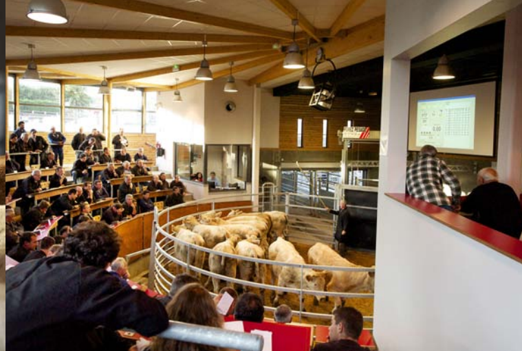
Auction market in Saint-Christophe-en-Brionnais.