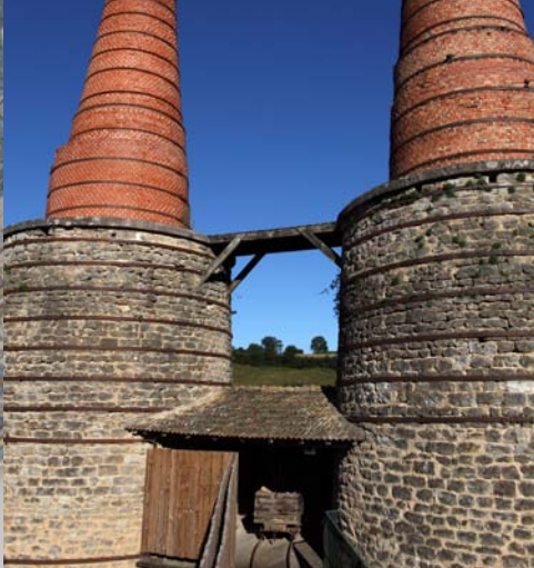
Lime kilns in Vendenesse-lès-Charolles (CMH, in 1998) and their powerful brick chimneys (19 th century).