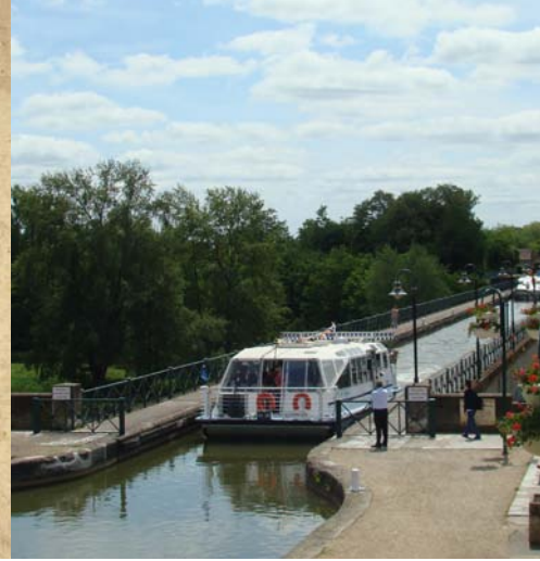
Digoin canal bridge, 1832-1836.