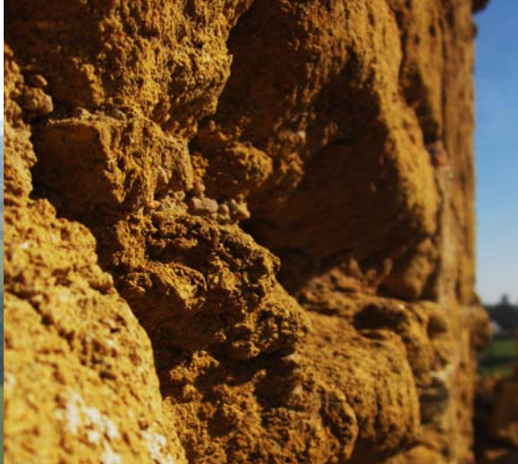
Crinoidal limestone (marine fossils), of a yellowish ochre hue, is one of the area's characteristic materials.