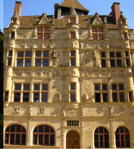
Facade of the Paray-le-Monial town hall (around 1525).