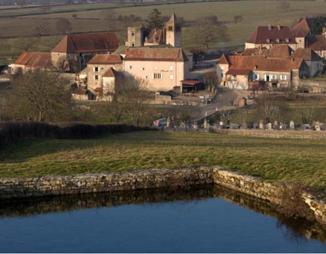
View of the village of Oyé.