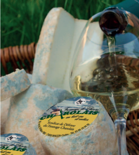
AOC certified Charolais goat cheese.