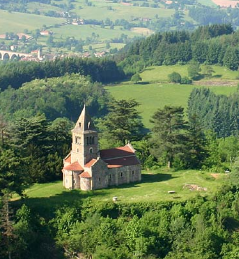
View from atop the Dun Mountain, with its 12 th -century chapel and the Mussy-sous-Dun viaduct, crossing the Mussy Valley, a tributary of the Sornin.