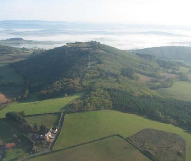
View of the Mont Dardon, forming the southern flank of the Morvan range.

Charolais-Brionnais country offers one charming landscape after another: From rolling hills to lush valleys, from forests to fertile pasturelands shaped by man since the 18th century.